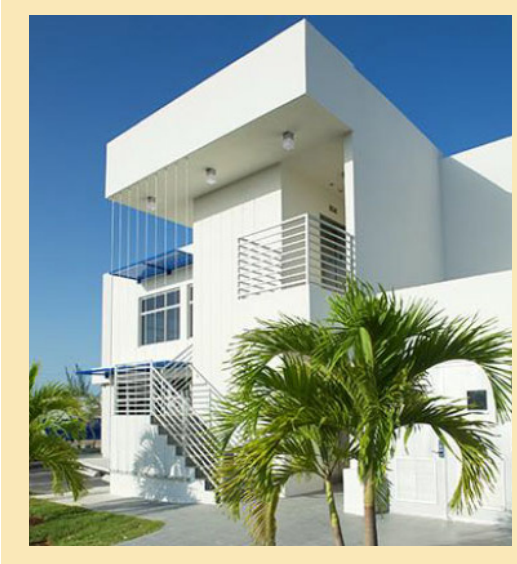
SWP's secure storage facility George Town, Grand Cayman

Strategic Wealth Preservation (SWP) is an international precious metals dealer and secure storage provider headquartered in the Cayman Islands. We specialize in the acquisition and secure storage of precious metals for individuals, companies, trusts and wealth management professionals on behalf of their clients. We deliver precious metals worldwide to homes and businesses and offer secure storage in vaults located in the Cayman Islands, Canada, the United States, Switzerland, Liechtenstein, Singapore and New Zealand. We also offer corporate disaster recovery services for businesses located in the Cayman Islands.